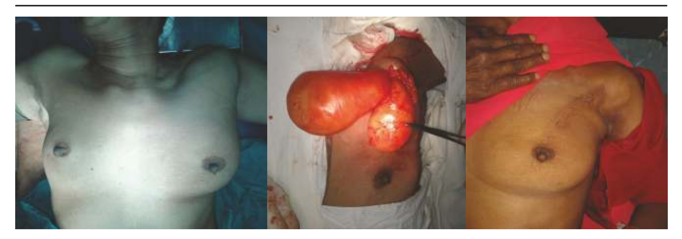
Fig.1a: Shows Preoperative, Fig.1b: Shows Intraoperative, Fig.1c: Shows Postoperative